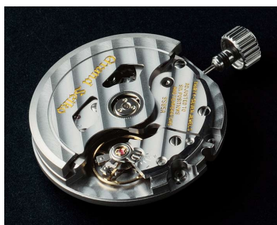
Automatic caliber 9S series

Never has a new luxury brand been launched to the world market with such a powerful array of technologies.