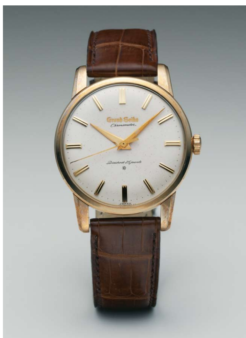
The very best of SEIKO since 1960

Since its launch exactly 50 years ago, Grand Seiko has been the very best of SEIKO. Inspiring its birth was a very simple and beautifully pure idea; Grand Seiko was to be more accurate, more durable, more legible and easier to wear than any other watch in the world. Today, Grand Seiko is a luxury brand that offers timepieces made by master craftsmen in SEIKO's two exclusive watchmaking studios, using exclusive movements and the highest grade materials. Each Grand Seiko watch is instantly recognizable because of its simplicity of form and its understated elegance. From the very first Grand Seiko watch in 1960 to the latest collection of today, every Grand Seiko has shared the functional beauty and design purity that has always been its hallmark. Grand Seiko is, simply, the very best of SEIKO.