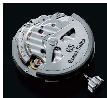
Spring Drive caliber 9R series