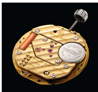
Quartz caliber 9F series