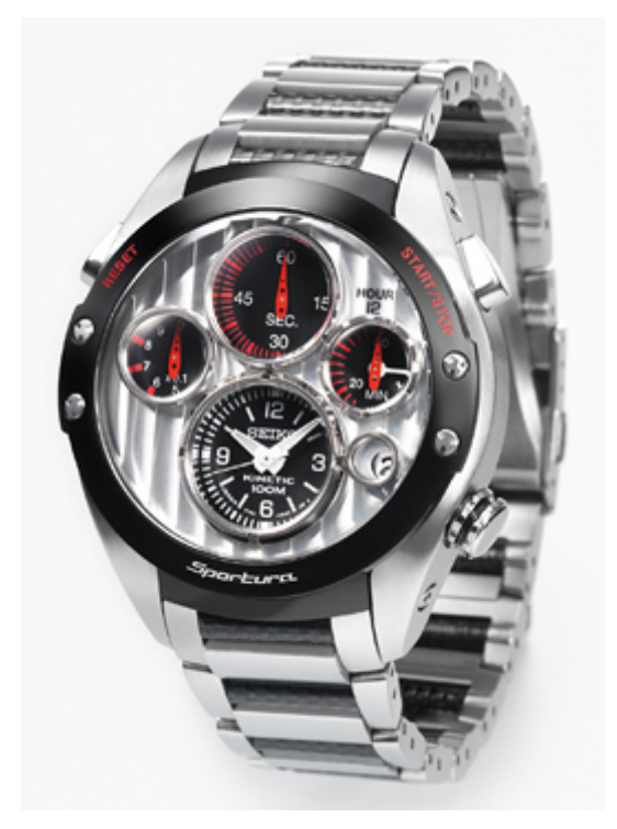
The Sportura Ultimate Kinetic Chronograph The F1 Driver Jenson Button's selection for 2007 SLQ023

The legibility is maximized with the use of crystals above each of the 5 sub dials as well as across the whole dial. Through the sapphire case back, the Kinetic rotor is visible, as is the engraving which echoes the shape and look of the disc brakes on the high performance sports car.