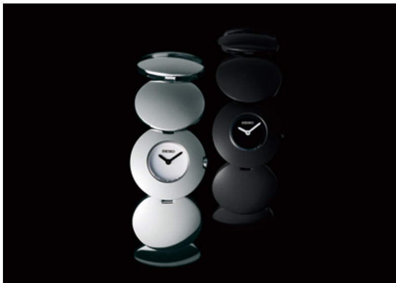
SUH001 , SUH003

In the Japanese tradition, the ladies of beauty are rooted firmly in the natural world of elements, materials and time. SEIKO's new creations for women draw their inspiration from this heritage.