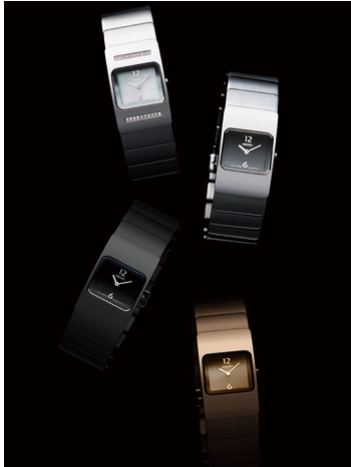
SYL821 , SYL813 SYL819 , SYL818

All the parts of roof tile design, Kawara , the earthen roof tiles used in traditional Japanese houses, are linked in a pleasing rhythm with one another to make a continuous and beautiful wave shape like the passage of the time.