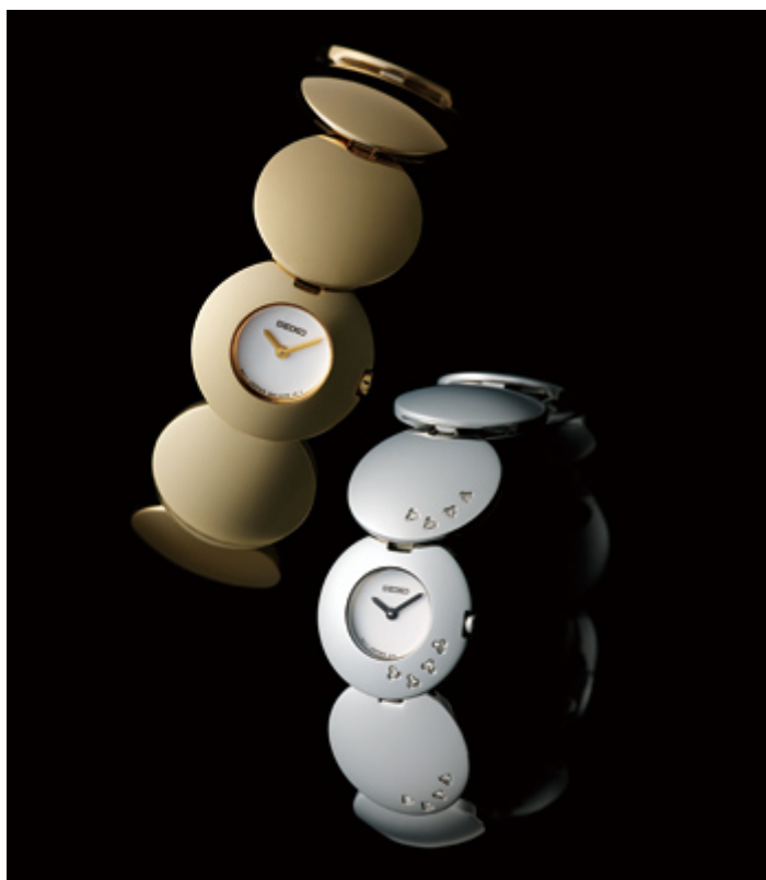
SUH002 , SUH005

The pebble design is called Go as the case and links of the bracelet are shaped like the stones in the traditional oriental game of the same name.